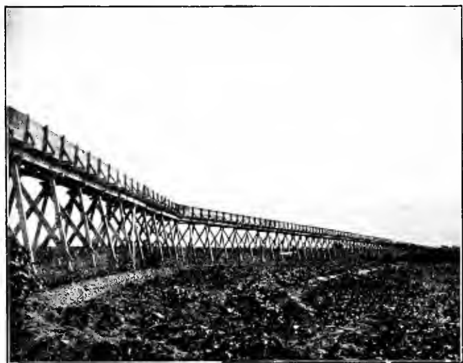
IRRIGATION FLUME, FORT ROMIE.